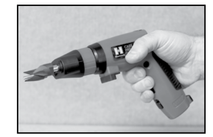
Pistol Grip Position

The Case Prep Duo is designed to be used as a handheld or bench top tool. The integrated rubber feet provide a non-slip base for benchtop use. The step in the front foot allows the tool to be placed over the edge of a work bench.