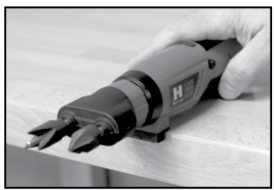
Benchtop Edge Position