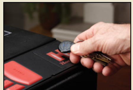
The three methods of instant RFID access consist of a card, bracelet, and key fob.